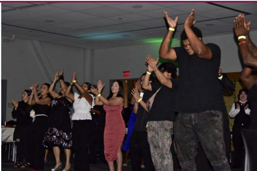
Students dance at the LMC Homecoming Dance, held Oct. 4.